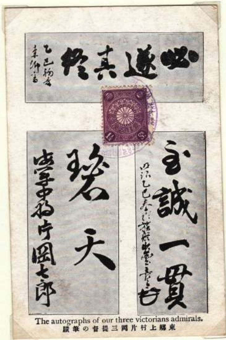
The autographs of our three victorians admirals. 東郷村上岡三提督の筆蹟

Admiral Togo's signature is in the top panel at the far left. Two other admirals' signatures appear in the lower panels. To the immediate right of Togo's signature is written: "from Kagoshima; admiral." The large script is a poem which literally translates: "Absolute reach true ending." The Tazawa definitive stamp (Scott 95) is tied to a commemorative cancel which reads: "Naval commemoration day of the war. 04-1906" Note the misspelling of 'victorious' in the English subscript.