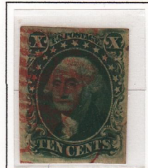
Scott# 15 ten cents