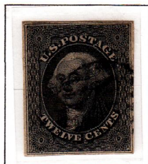
Scott #17 1851 series twelve cent stamp.