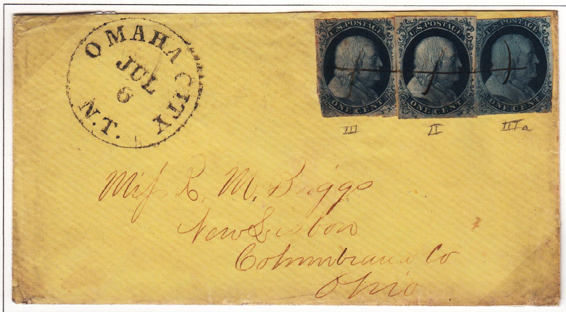
Omaha City N.T. Jul 6 postmark on cover with three types of one cent imperf stamps, Type II (#7), Type III (#8) and Type IIIa (#8a). Stamps are pen cancelled. VERY RARE USE.