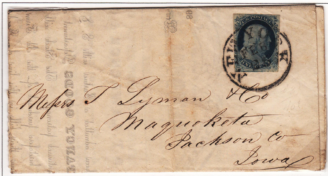
New York Feb 25 (1855) cancel on preprinted circular to Maquoketa, Iowa. One cent stamp paid the unsealed circular rate. The circular announced a new address for a company that sole "soft finished bleached goods".