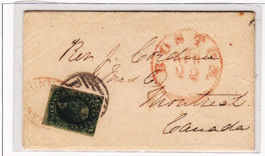
Ten cent #16 type IV stamp Pos. 65L.1 recut at top. Boston, Apr 22 cancel to Montreal, Canada. Canadian receiving marks on back. Has faint Canadian exchange office marking on front. Stamp was used in 1856.