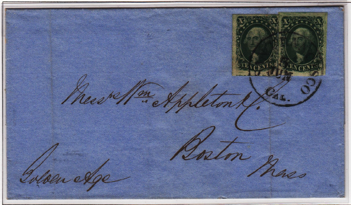
Transcontinental cover with San Francisco Cal. Jun 5 (1856) cancel to Boston. One stamp (left) is type III #15 and right is type II # 14. Carried on Pacific Steamship Line "Golden Age". Stamps paid the double ten cent rate for a letter over 1/2 oz, traveling over 3000 miles.