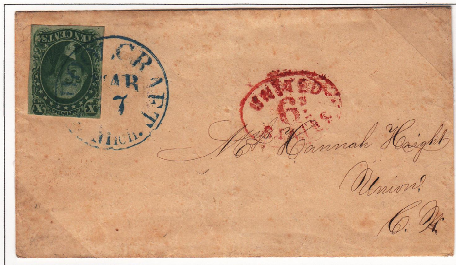
Ten cent #13 type I with blue Schoolcraft, Mich. Mar. 7, 1857 cancel to Union, Canada West (Ontario) Canadain credit marking and receiving marks on back.