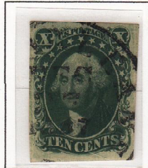
Scott# 14 ten cents