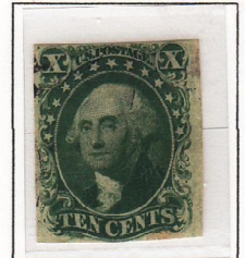
Scott#16 ten cents