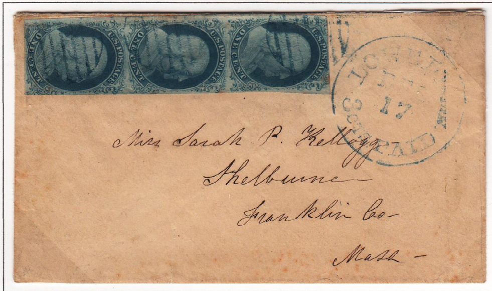
Type II Imperf.

Vertical strip of 3 one cent Type II #7 stamps, postmarked Lowell, Mass. 3 cts PAID Dec 17, circa 1851-53. Stamps canceled with blue circular grids. Stamps paid the new single (1/2 oz.) or less rate on mail traveling under 3000 miles within the US.