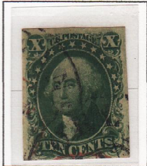
Scott# 13 ten cents